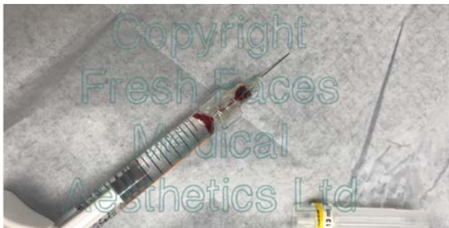
I was treating a forehead, having marked carefully all my zones for safe placement of product, knowing the approximate position of supratrochlear and supraorbital arteries, and taking steps to avoid them. Injecting onto the periosteum with Belotero Balance, using a 30 gauge needle, I aspirated for 10 seconds. As I got to 9 out of 10 there was a significant flash back.