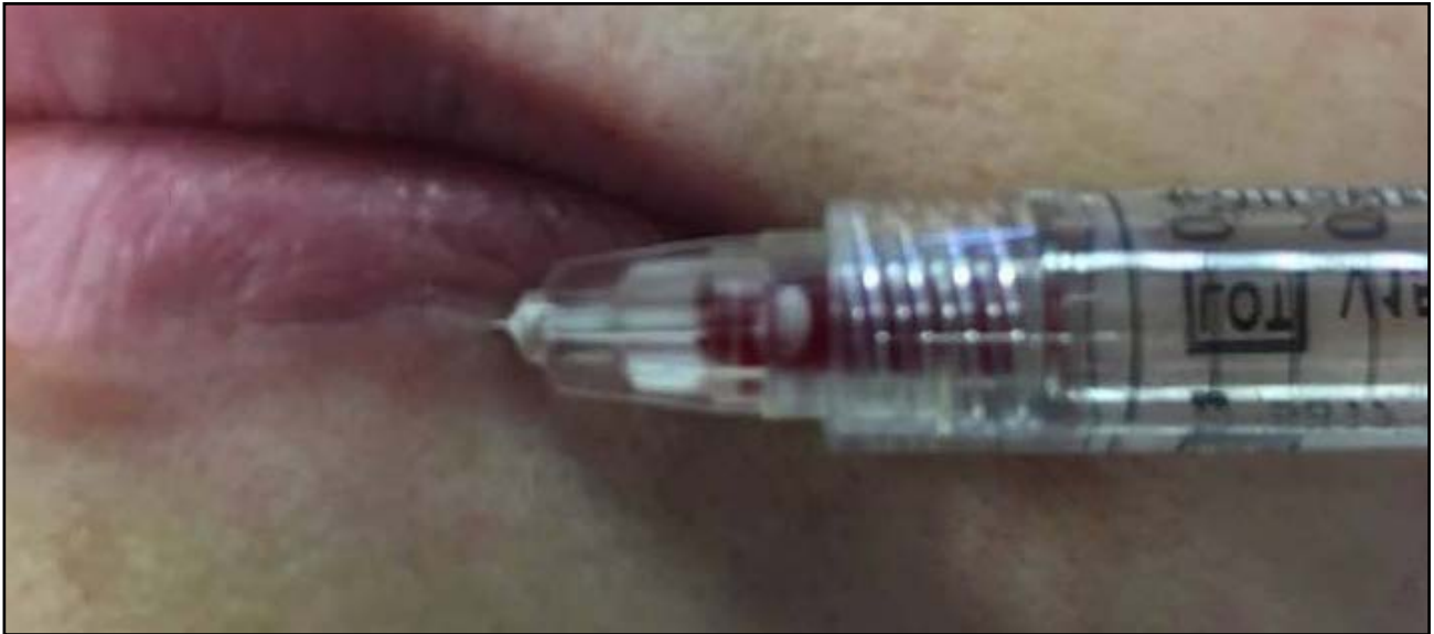
Treating the lips with a Juvéderm Vycross range product using a primed 30G needle.